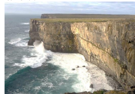
High Cliffs Inis Mór