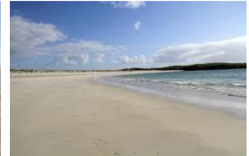
Dog's bay near Roundstone