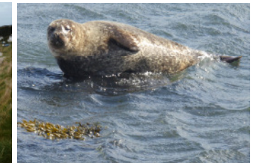
seal on Rathlin Island