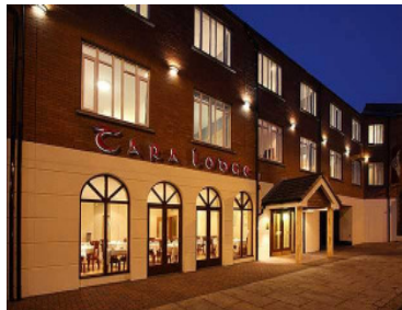
***Tara Lodge, Belfast

3 nights in the Tara Lodge, Belfast, 5 nights at the Marine Hotel, Ballycastle.