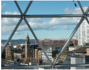
Belfast von oben