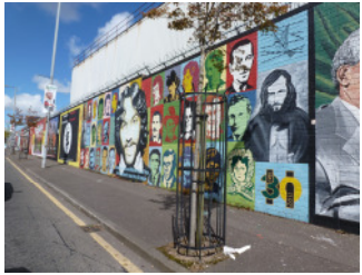
Murales in Belfast