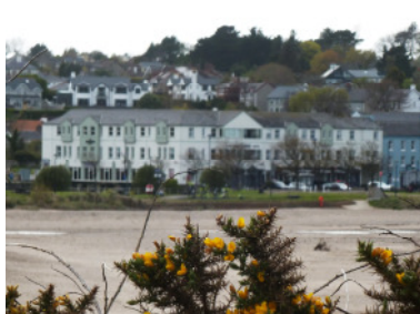
***Marine Hotel, Ballycastle