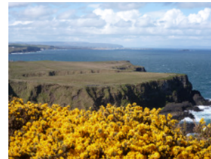
Cliff walk Giants Causeway