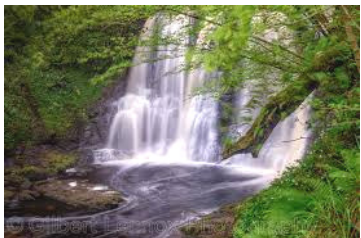
Glenariff National Park

Sunday, 23 April: morning to your own disposal, afternoon in the Corrymeela Centre (Centre for Peace and Reconciliation Work), focus: the role of women in the peace process, lunch and evening meal in the center.