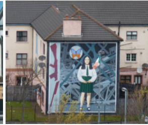
Murales in Derry