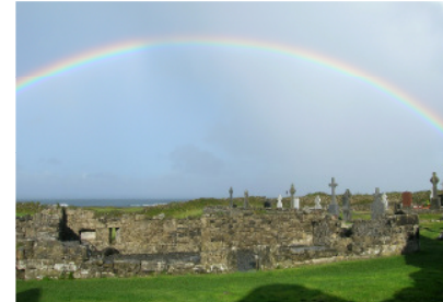
Inis Mór, Aran Islands

Inis Mór, Aran Islands + Skellig Micheal + Glendalough