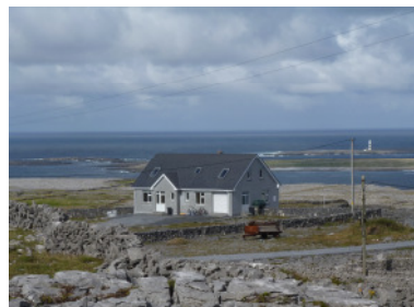
Holiday home: 5 Min. walk from centre, luxurious, comfortable selfcatering house with spectacular 180 degree seaview from living room.