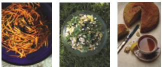
delicious recipes from Prannie's seaweed book

Day 8: official end of the program in the morning