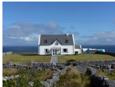
Elizabeth's House (Centre) cosy and comfortable selfcatering accommodation, lovely seaview, 2 rooms