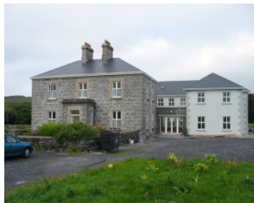
Kilmurvey House, Inis Mór small, very comfortable *** Guest-house with friendly landlady and excellent food